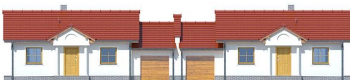
JASPER – A TWIN BUNGALOW - Project FRONT