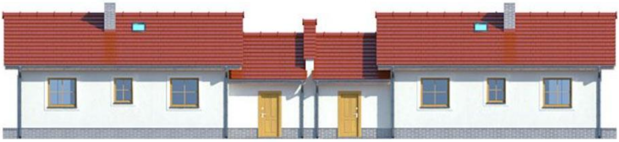
JASPER – A TWIN BUNGALOW - Project REAR